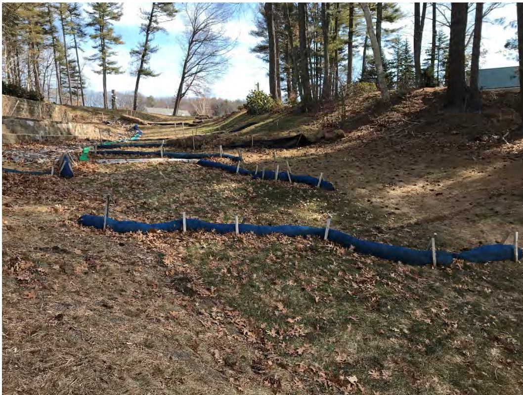
Fig 10: Slope below the manhole at Gundalow Landing/east side of the bay. Viewing east. (03-16-21)