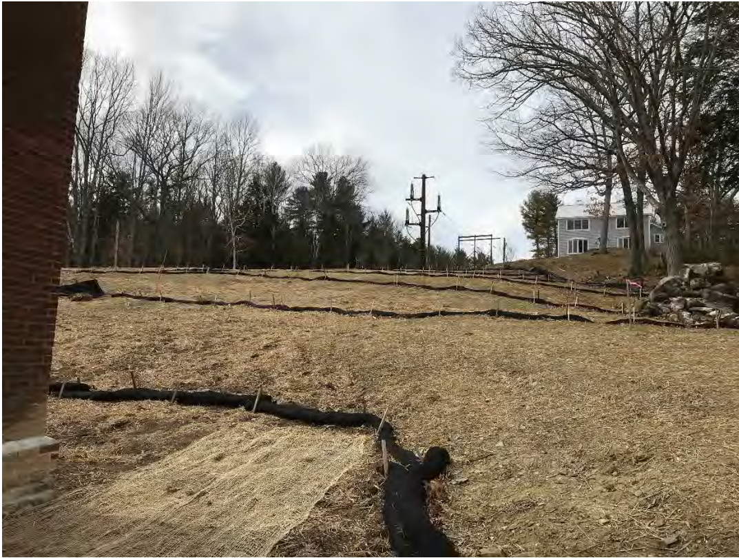
Fig 3: Slope above the cable house at the Eversource property/west side of the bay. Viewing southwest. (03-16-21)