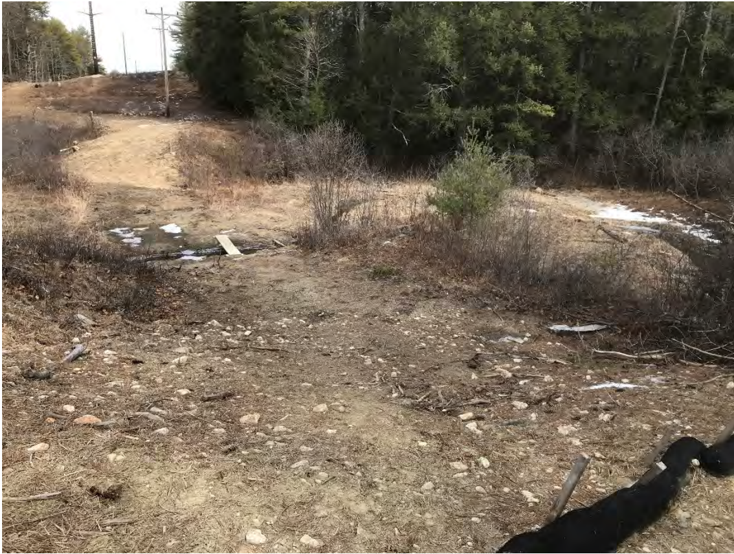
Fig 7: Stream DS46 between Strs. 51 and 52. Viewing northeast. (03-16-21)