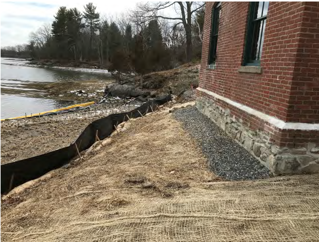
Fig 2: Slope between the cable house and salt marsh restoration at the Eversource property/west side of the bay. Viewing south. (03-16-21)