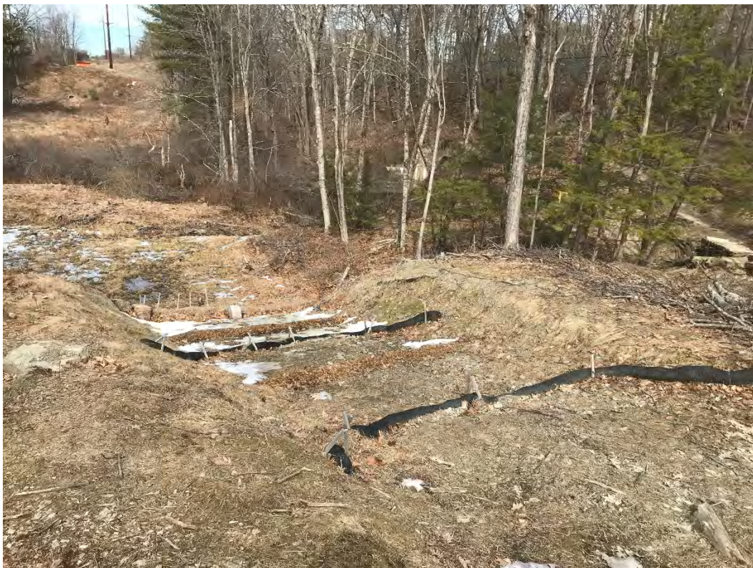
Fig 8: Lower portion of slope between Strs. 28 and 29. Viewing northeast. (03-16-21)