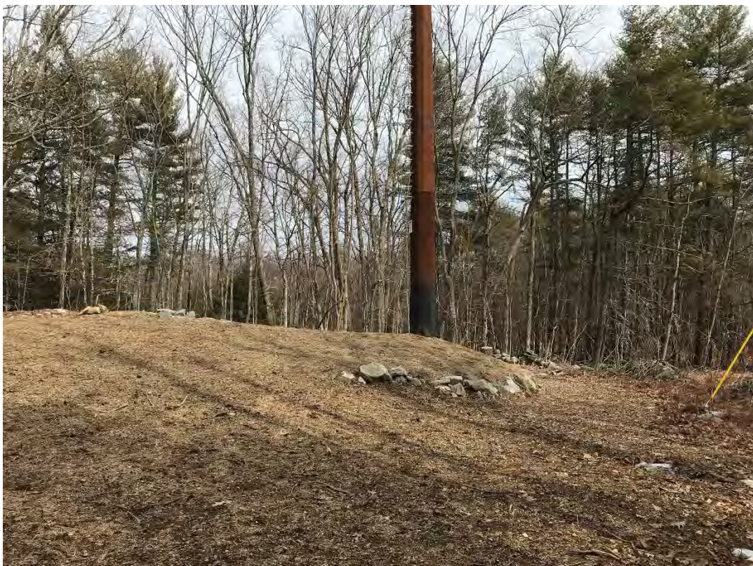
Fig 6: Str. 90 work area. Viewing northeast. (03-16-21)