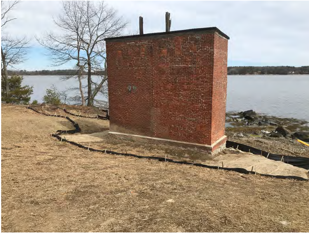
Fig 1: Slope leading down to cable house and salt marsh restoration at the Eversource property/west side of the bay. Viewing northeast. (03-16-21)