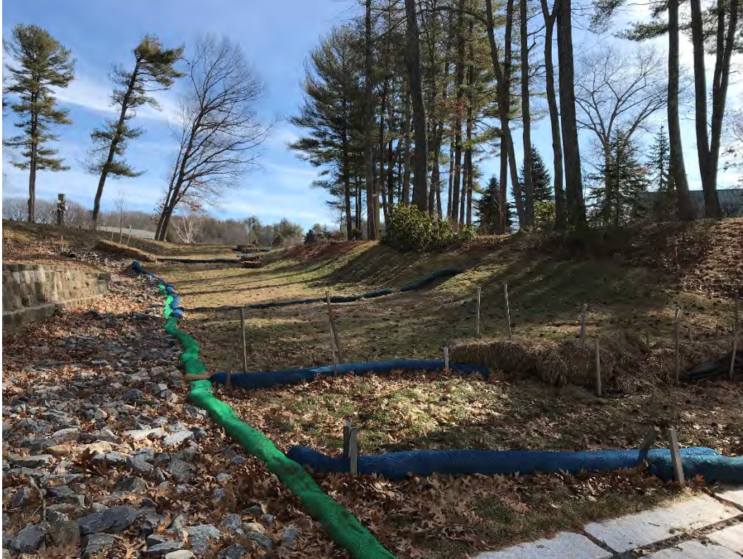
Fig 9: Slope above the manhole at Gundalow Landing/east side of the bay. Viewing east. (03-16-21)