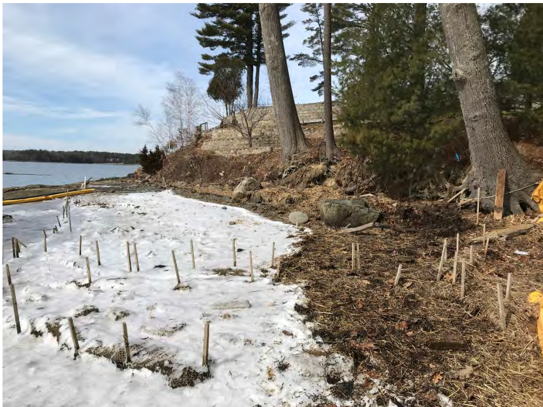
Fig 12: Salt marsh restoration at Gundalow Landing/east side of the bay. Viewing south. (03-16-21)