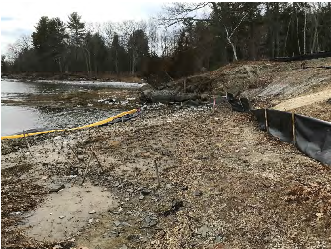
Fig 4: Toe of the slope and salt marsh restoration at the Eversource property/west side of the bay. Viewing south. (03-16-21)