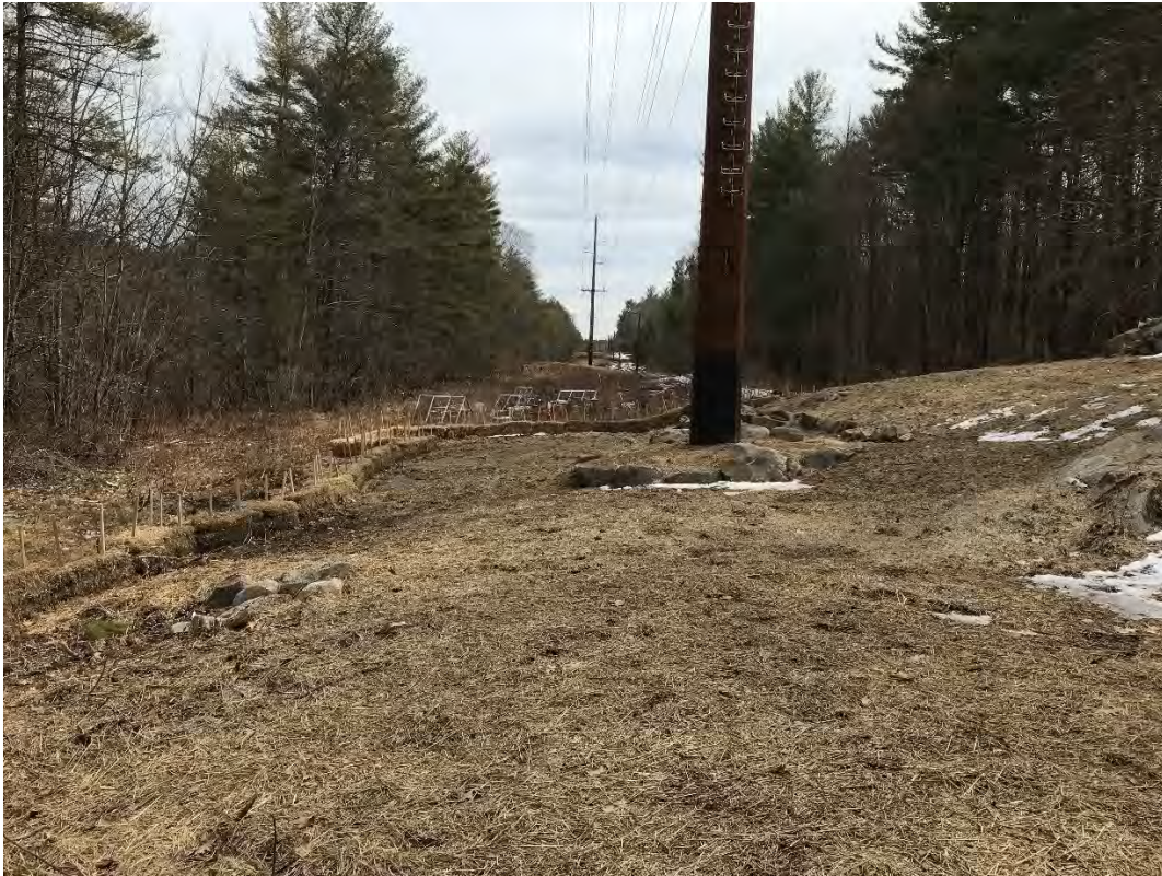
Fig 5: Str. 89 work area. Viewing southeast. (03-16-21)