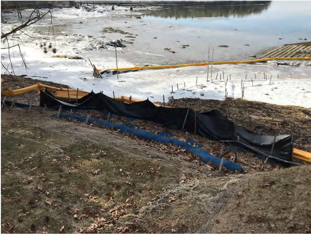
Fig 11: Toe of the slope at Gundalow Landing/east side of the bay. Viewing south. (03-16-21)